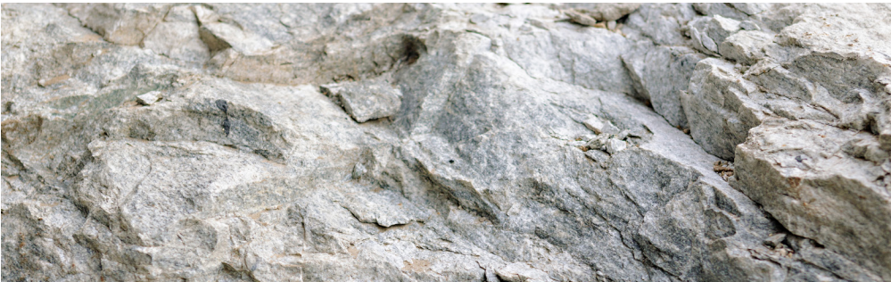
Sedimentary rock that Fenario was built into.