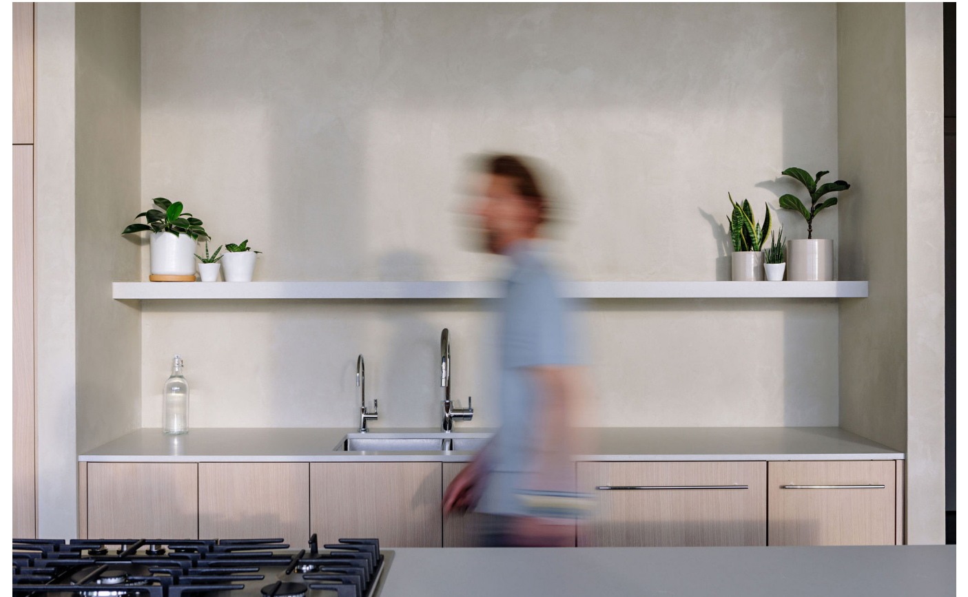
Warm minimalist built in millwork throughout.