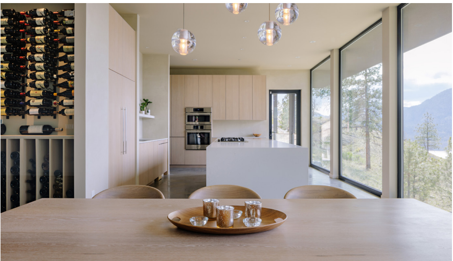
With unmatched views of Skaha Lake, every interior space was intentionally designed to maximize natural light.